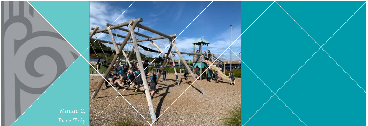
Mauao 2, Park Trip