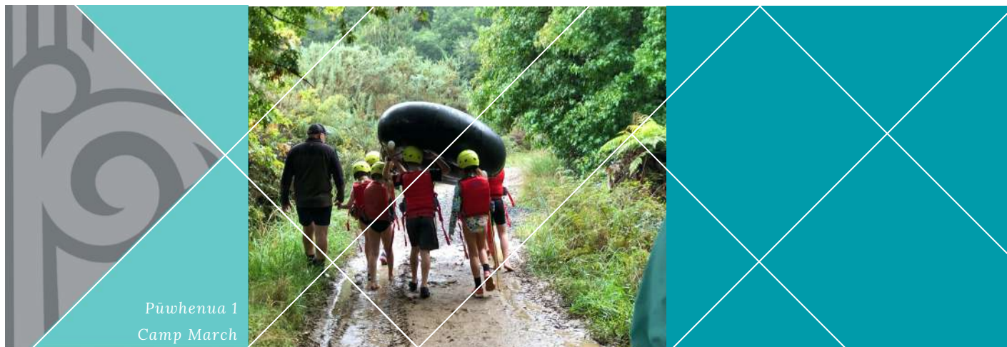
Pūwhenua 1 Camp March